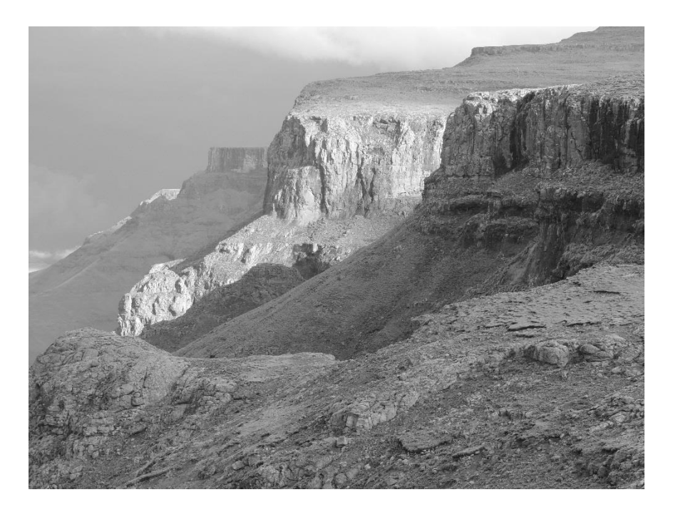
Let the heavens rejoice; let the earth be glad! - Psalm 96:11