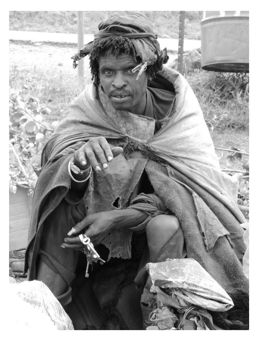
I will give you the keys of the kingdom of heaven; whatever you bind on earth will be bound in heaven, and whatever you loose on earth will be loosed in heaven. – Jesus of Nazareth